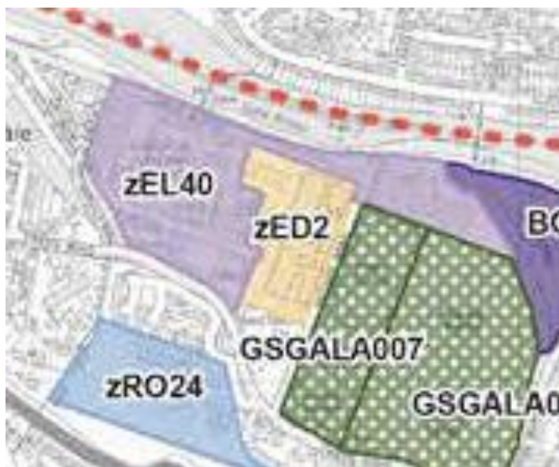
Extract from SBC LDP Proposals Map